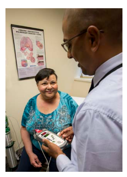
Please talk with your provider if you have any questions about your test.