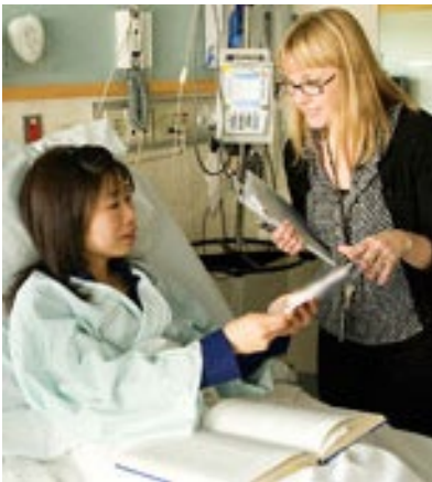
A patient services specialist will gather your daily menu choices.

The operation supervisor works closely with the nurse manager to help the Rehab Unit run smoothly. The operation supervisor makes sure that the non-medical needs of our patients and families are met. The operation supervisor also oversees the interactions between patients and staff.