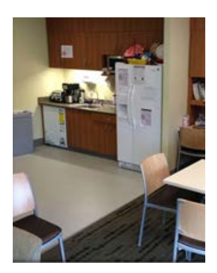
The Family Lounge has a kitchen and other amenities to help make your time in the NICU more comfortable.