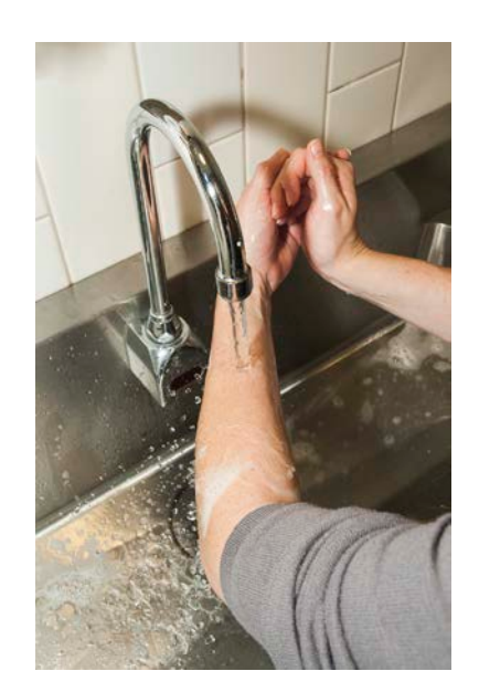
Everyone who visits the NICU must wash their hands and arms up to the elbows before they enter the unit.