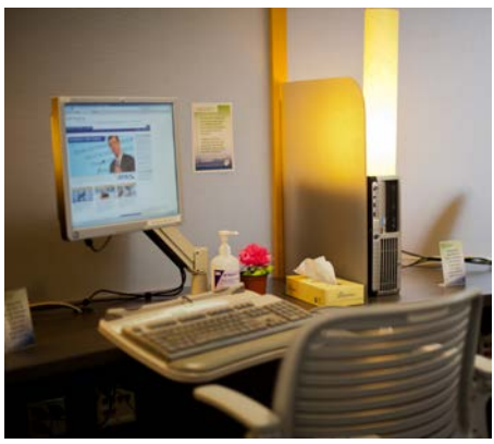
The Health Information Resource Center is on the 3rd floor of the hospital, next to the Gift Shop.

Thank you for working with us to create a safe, healing, and positive environment in the NICU!