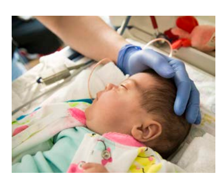
"I wish someone had told me that even with all of the hard days and sadness, there is truly something wonderful and magical about the NICU. It can be a really wonderful place."