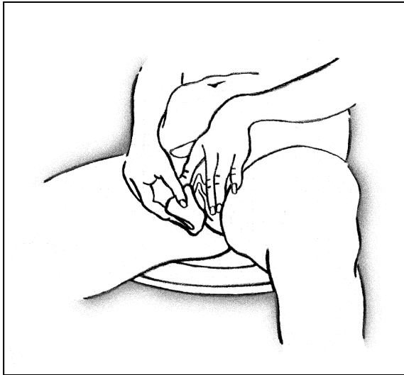
Steps 4 and 5