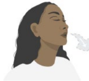
Exhale through your mouth, "1, 2, 3, 4".