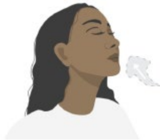
Inhale through your nose, "1, 2".

Caution: Breathe in and out slowly, and at a consistent pace. This will help you avoid hyperventilating (breathing too rapidly).