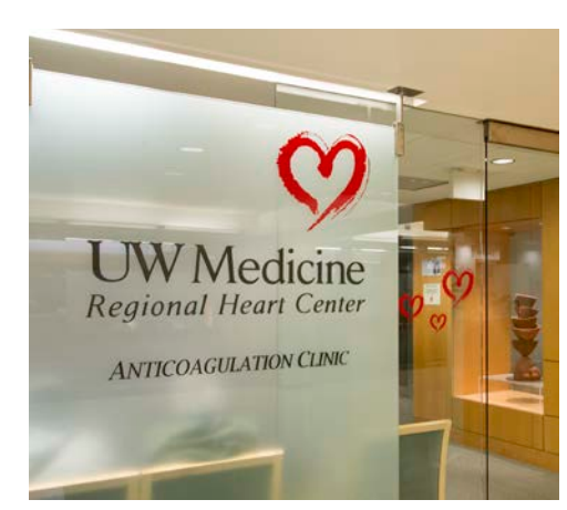
The Echo Lab is inside the Regional Heart Center, on the 3rd (main) floor of the medical center.

We welcome you to the Echocardiography (Echo) Lab at University of Washington