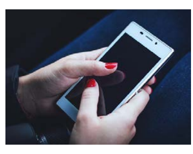
Call your doctor or go to the emergency room right away if you have the symptoms listed here.