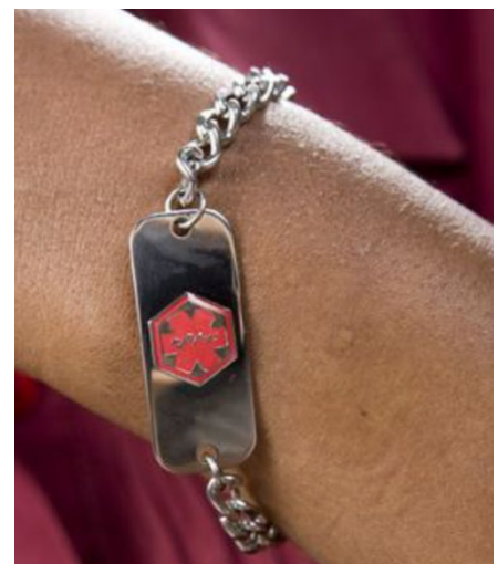
Think about wearing a medical alert bracelet or necklace that tells providers you take warfarin.

It is very important to tell all your healthcare providers that you are taking warfarin. Tell your doctors, your dentist, and all pharmacists who fill your prescriptions. Being on warfarin may affect how they care for you in some situations.