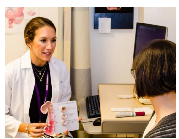
Talk with staff at UW Medicine Specialty Pharmacy 24 hours a day, 7 days a week.