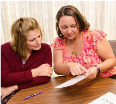
Our staff will work with your insurance to make sure they cover the costs of your medicine.

UW Medicine Specialty Pharmacy follows Washington State laws when filling prescriptions with generic medications. If we need to substitute another brand for your usual medication, we will call you.