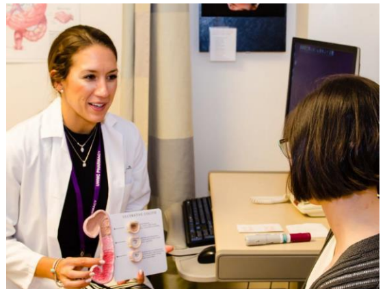
Talk with staff at UW Medicine Specialty Pharmacy 24 hours a day, 7 days a week.