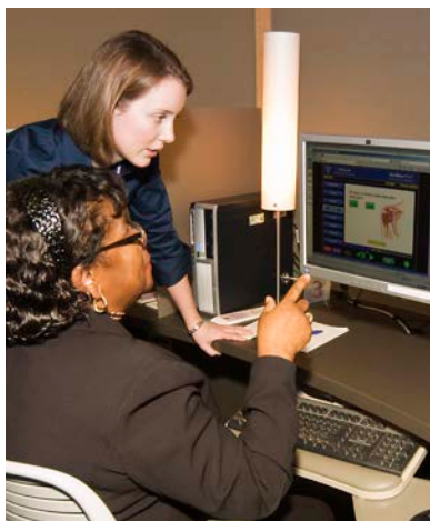
The Health Information Resource Center offers UWMC patients and families free use of computers.

magazines, phone cards, stamps, gifts, candy, snacks, and beverages. Weekday hours are from 6:30 a.m. to 9 p.m. Weekend hours are from 8:30 a.m. to 5 p.m.