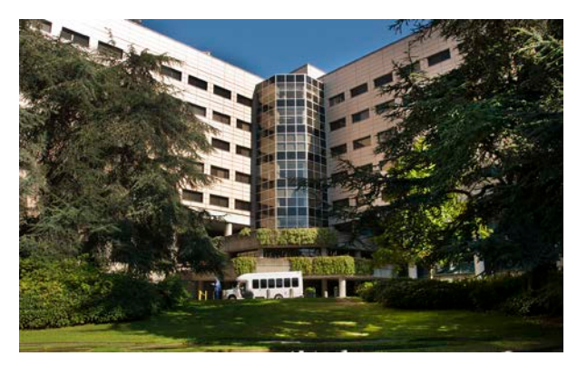
University of Washington Medical Center

This booklet provides information about our ICUs. We hope it will answer most of your questions about these units. Please talk with a staff member if we can help in any way.