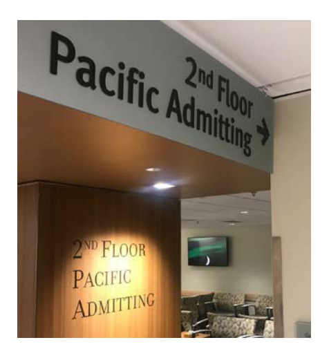
The doorway to 2nd Floor Pacific Admitting

We will do our best to start your procedure on time. Please be patient if emergencies in the hospital cause a delay.